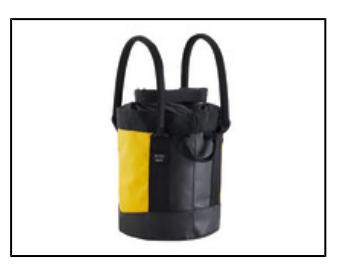
The two large handles allow the bag to be carried by hand and can also haul up to 50 kg.