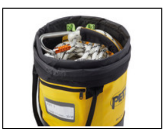
A marking area on the outside allows you to quickly and easily identify the contents of the bag.